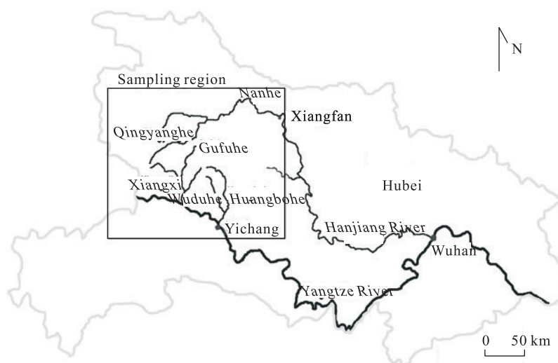
Figure 1. Thirty-four sampling sites were distributed in the western part of Hubei Province, China.

To advance water-quality control by biological monitoring, we aimed to develop a tool for river water quality assessment in China. The tool was set up exemplarily for selected tributaries of the middle reach of the Yangtze River in the western part of Hubei